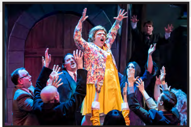
THE ADDAMS FAMILY | 2017