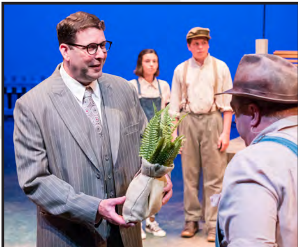
TO KILL A MOCKINGBIRD | 2017

2018 MAIN STAGE ADVERTISING SEASON INTO THE WOODS | MAY 3-19 A FEW GOOD MEN | MAY 31-JUNE 16 SNOW WHITE | JUNE 27-30 FUN HOME | JULY 12-28 LEADING LADIES | AUGUST 9-25 ON THE TOWN | SEPTEMBER 6-22