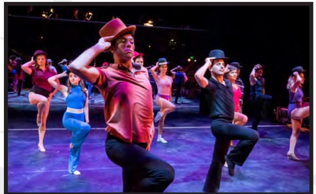
A CHORUS LINE | 2017

For 50 years and counting, we have focused on re-imagining classic children's stories and fairy tales for a modern, family audience - and invite audiences of all ages to experience the magic of live theatre.